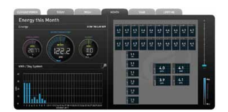
Monitor your system online or via your smart phone app from anywhere in the world.